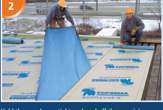
Hold the membrane tight and peel off the remaining silicone release film diagonally.