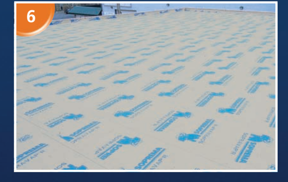
Once the installation has been completed, the SOPRAVAR'R membrane provides temporary protection against inclement weather.

If you have any questions about this product or its installation, please contact your SOPREMA representative.