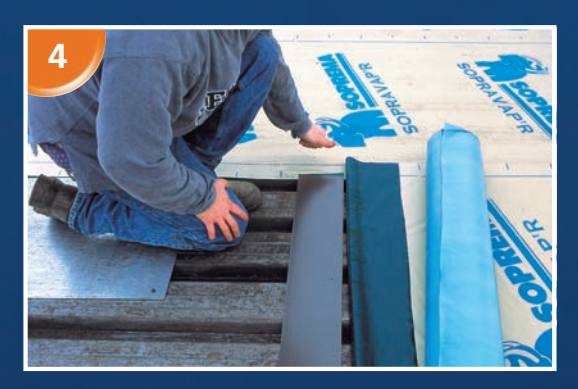
Where the ends of the rolls overlap (15 cm / 6 in.), install a metal plate* to support the end laps between the flutes and ensure a perfect end lap seal. *Format: (15 cm x 106 cm / 6 in. x 42 in.)