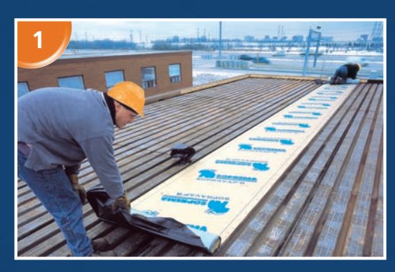
Roll out the SOPRAVAP'R membrane on the clean, dry metal deck. Peel back the first metre (3 ft.) of the silicone release film and adhere the membrane in place.